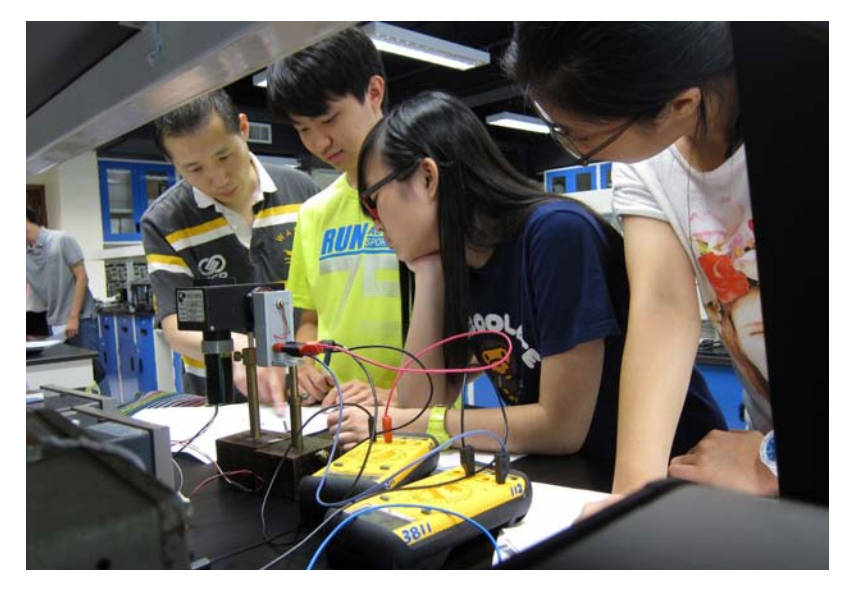
Our course instructors strive to ignite students' interest in science.