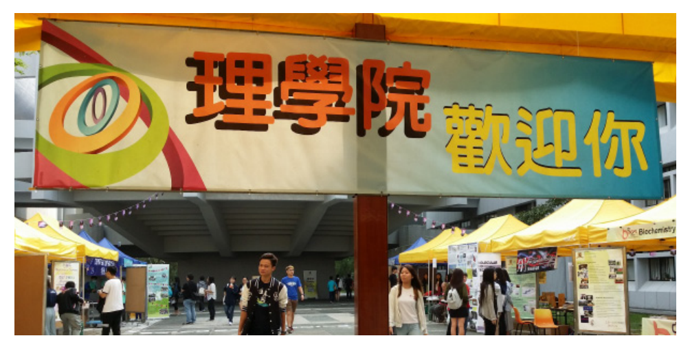
A jumbo and eye-catching banner to welcome our visitors

CUHK hosted the Orientation Day for Undergraduate Admissions on 5 November. Over 54,000 visitors including secondary students, teachers and parents paid a visit to this beautiful campus. Various admission talks, laboratory tours, demonstration and sharing sessions, tailored for prospective students, were organized by units of the Science Faculty. Not only programme teachers partook in explaining curriculum or learning path to the potential freshmen and parents, but also peers of students, who are now studying in different programmes, shared their vivid stories in the university under the exhibition booths.