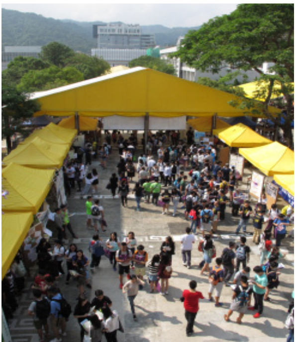
Programmes of Science Faculty housed under the well-decorated marquee to showcase their curriculums and course details.