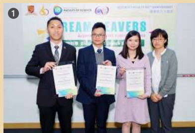
圖1 (由左至右) :

In the two public lectures, the audience not only learned about scientific knowledge about women's health, eye diseases, and nutritional science, but also gained a deeper understanding of biodegradable materials and materials chemistry.