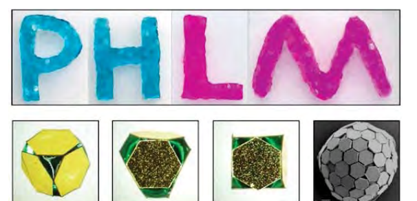
Fig. 1 Initials of the term polyhedral LM: PHLM, formed using transparent 2.35 mm-sized plates and dyed water. LMs with different polyhedral morphologies. SEM image of a dried cyanoacrylate-treated 3 µL polyhedral LM using 0.34 mm-sized plates.

A new type of armored droplets, so-called polyhedral LMs are introduced. The polyhedral LMs consist of liquid droplets stabilized by hexagonal plates made of poly(ethylene terephthalate), which adsorb to the liquid-air interface. Depending on the specific combination of plate size and droplet diameter, the plates self-assemble into highly ordered hexagonally arranged domains. Even tetrahedral-, pentahedral-, and cube-shaped LMs composed of only 4 to 6 plates are demonstrated. Highly asymmetric and super-long polyhedral LMs and letters are obtained due to the strong interfacial jamming exerted by the rigid hexagonal plates.